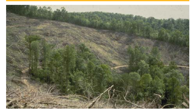
Buffer strips such as the one left in this harvest help cool water temperatures and filter out sediment.