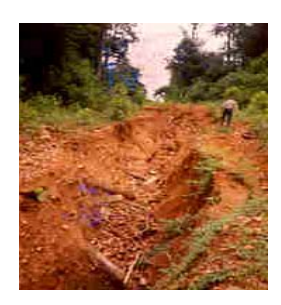
Lack of water contol structures washed out this road.